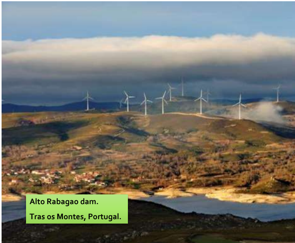
Alto Rabagao dam. Tras os Montes, Portugal.